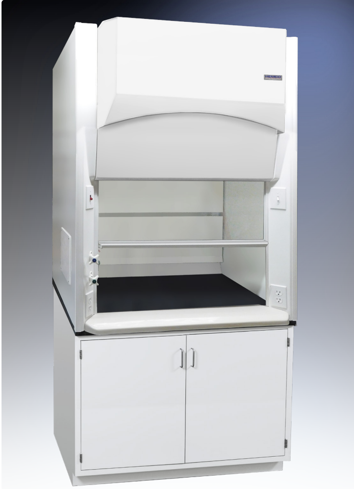
UniFlow Auxiliary Air Hood Cat. No. 21521 shown with optional epoxy resin worksurface, fixtures, and base cabinets.

Zero room air requirements. The Fume hood exhaust is equal to the auxiliary supply air, thereby zero room air is required. With the sash in the 1/2 open position and face velocity of 100 feet per minute, the CFM required equals the air supply. The hood exhaust air plus auxiliary air make up for room supply deficiencies. Since expensive tempered room air is not required, Auxiliary Air Fume Hoods provide energy savings.