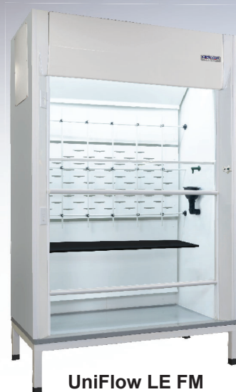
UniFlow LE FM