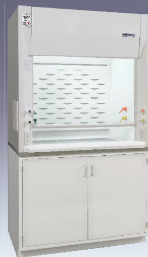
UniFlow LE AirStream