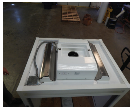
Filter Unit top view, with filter removed