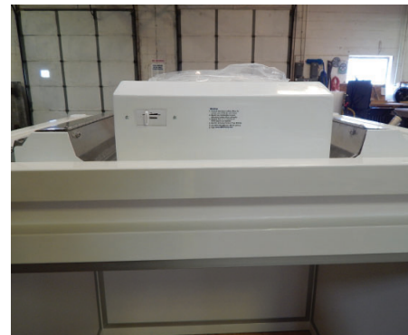
Filter Unit front view