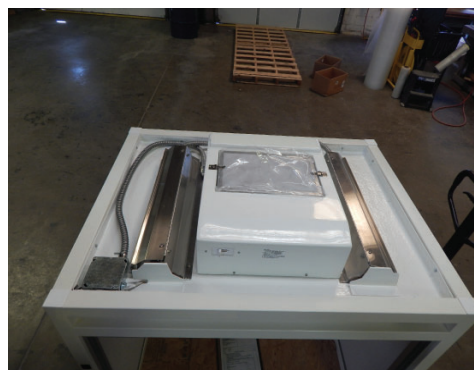
Filter Unit top view, with filter installed