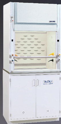
UniFlow CE AirStream