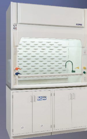
UniFlow SE AireStream High Performance Energy Efficient Laboratory Fume Hoods