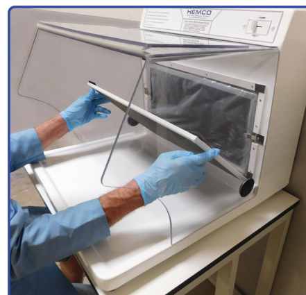
Install particle prefilter and attach using velcro