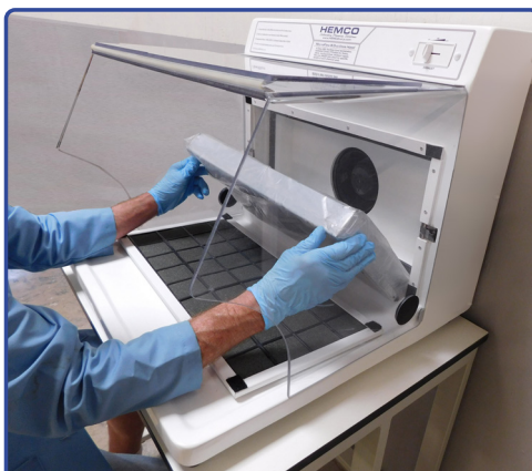
Remove plastic wrap from carbon filter & snap into place using filter clips